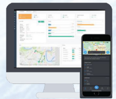
App & Web - register/edit contact number for crash & theft alerts, device status update + Vehicle tracking