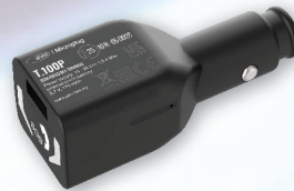
FMP100 Cigarette lighter plug device with M2M SIM Card - 1 telco